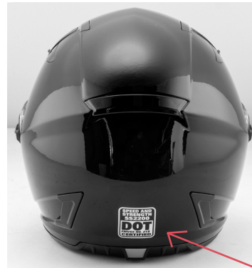
Helmet Model on back of helmet